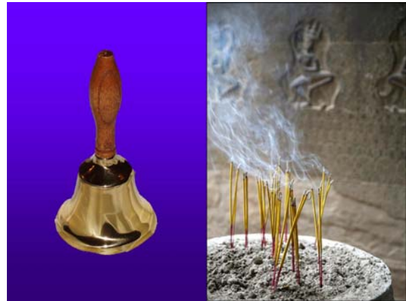
Welfare reform tools: bell and incense