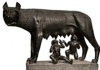
Romulus and Remus

Head Start, considered by many the gem of the Great Society, is a prime example of the need to improve an ongoing program. Since that first summer of 1965, about twenty-five million children have passed through the program, at a total cost of about $145 billion, and yet we are still arguing about whether Head Start “works.” I’ve contributed some to this argument, so I know it well.