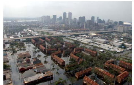
New Orleans after Katrina (2005)

Many of those in the room (dare I say most?) were cheered by Tuesday's results. After years of questionable policies and catastrophic management, there are, I fear, many hidden Katrinas yet to surface, as evidenced by the current financial crisis. Even those who did not vote for Barack Obama should wish him—and our nation—a successful presidency.