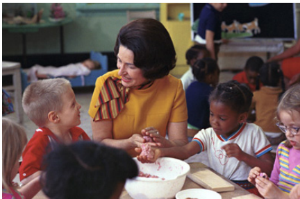
Mrs. Johnson at a Head Start Center

In a nutshell, here's my argument: In the 1960s, various social programs were started (like Head Start) or dramatically expanded (like AFDC). Loosely, we call that period of