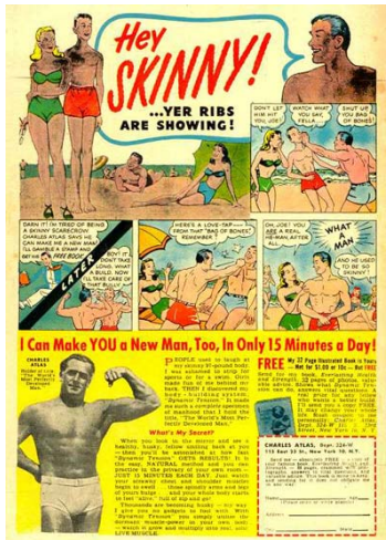
Charles Atlas advertisement